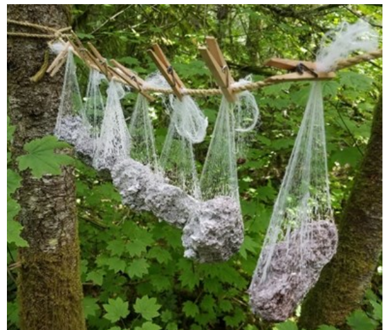
Figure 1: soil clods dipped in saran, hanging to dry

NRCS soil survey staff Jason Martin, Brandi Baird, Taylor Cullum-Muyres excavated one location by hand to describe and characterize the site, and sample the soils for analysis at Kellogg National Soil Survey Lab in Lincoln, NE. This site was the third of five planned sites for the field office. At each site, three bulk density samples were collected from each horizon as well as three liters of bulk sample. Before backfilling, NRCS staff installed soil moisture sensing probes at depths corresponding to the soil moisture control section as described in Soil Taxonomy (Soil Survey Staff 1999). This particular pit classified as fine-loamy, isotic, mesic Typic Palehumult, with Apt (fine, isotic, mesic Typic Haplohumults) as the nearest soil series match. Soil temperature probes are placed at a depth of 50 centimeters. The probes will remain for two to four years to collect adequate data to verify or update the moisture regime.