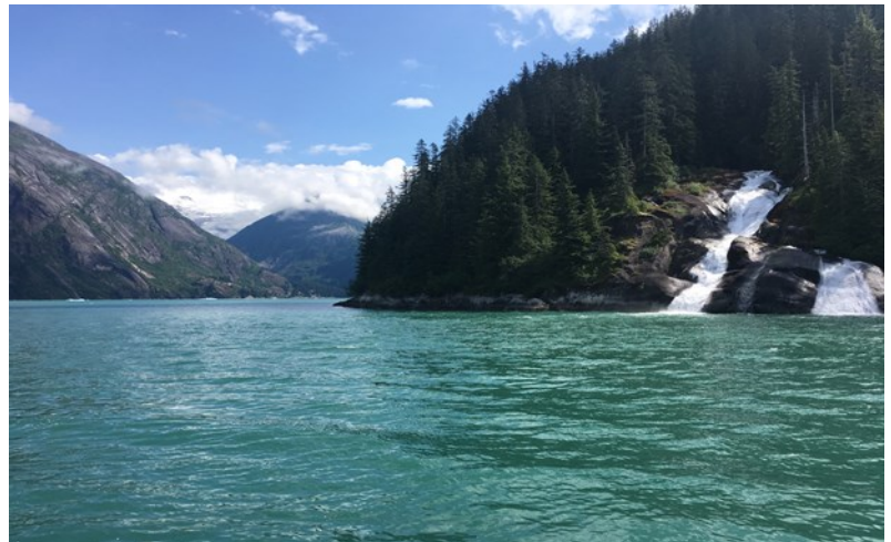
Figure 4. Waterfalls and granite cliffs along the Tracy Arm Fjord.

On a day off, Vincent and I took the opportunity to take a tour on a 65-foot clipper ship that traveled along the Tracy Arm Fjord. I marveled at the ephemeral beauty of the South Sawyer Glacier as it calved right in front of my eyes, dropping blue ice into the water, the glacier continuously undergoing change. Everyone aboard the clipper ship waited in anticipation of the next calving of ice, dropping into the placid fjord, with the sound traveling off the granite cliffs, into the beyond. As the ship traveled down the fjord on an unusually sunny and warm afternoon, a variety of Alaska wildlife that I had not seen before was visible from the vessel: bald eagles, ravens, mountain goats, bears, whales, and harbor seals.