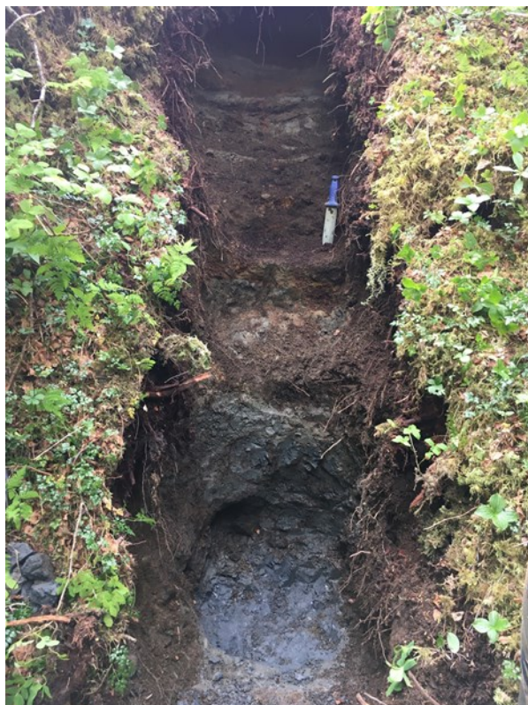
Figure 1. Fossilized clams from the Gastineau Channel Formation were found at the bottom of this very deep soil pit.

The soils in Southeast Alaska are located in the perhumid subzone of the coastal temperate rainforest. As one might infer from the word, perhumid, water is of great significance to the ecosystem in the Alaska Panhandle. The mean annual rainfall in these forests range from 141 cm to 300 cm; it's not unusual to receive frequent rain showers in July, as I soon discovered! All of that rainfall allows an abundance of plant productivity and a steady supply of organic litter on the forest floor that decomposes slowly due to the cooler climate.