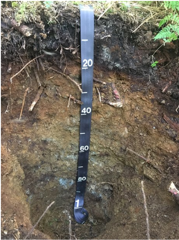
Figure 3. An example of one of many soils seen in the perhumid coastal rainforest.

The facilities at the Pacific Northwest Research Station in Juneau were stunning to see, the building is certified LEED Gold, with high-efficiency ground source heat pumps and a heat recovering ventilation system. The exterior house posts that adorn the entrance to the building, Eagle and Raven, were carved by a Tlingit carver. I learned so much about soil and landscape relationships in