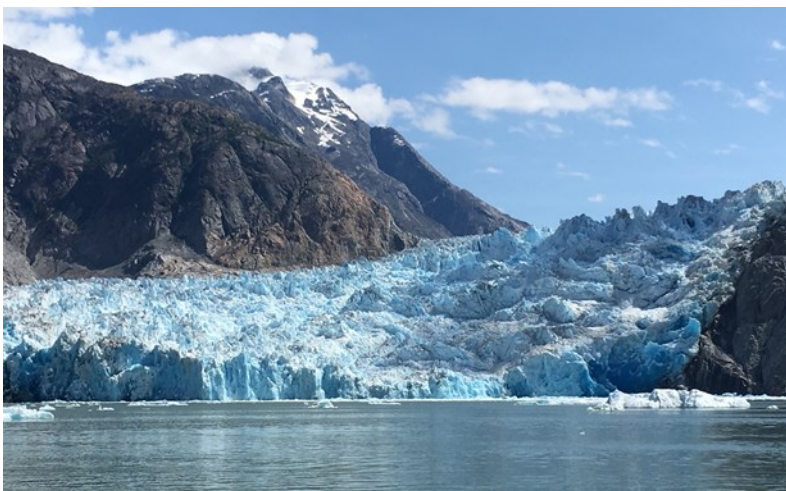
Figure 5. The tidewater South Sawyer Glacier at the head of the Tracy Arm Fjord. The glacier calved several times as the ship floated at the mouth of the fjord.

this unique ecosystem during this trip. The opportunity to not only learn about Alaska's coastal rainforest via researching published literature but also being able to view the landscape and see the soils in person was incredibly enriching and insightful for the beginning steps of my research. I cannot wait to continue this project come fall, at Oregon State University!