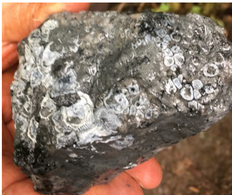
Figure 2. Fossils from the Gastineau Channel Formation. Other fossils previously discovered in the Gastineau Channel Formation in Juneau range from 9,500 yr BP to 12,000 yr BP.

As we dug soil pits and collected samples, the influence of precipitation on the landscape and the soil was apparent by observing properties within the soil horizons, including podzolization. The metaphor of soil memory immediately came to mind as we dug soil pits on different landscape positions within the forests. I came across a lot of interesting soils (no Histosols on this trip, hopefully next time), including Spodosols, Entisols, and a yet to be identified soil containing fossils of clams that were originally deposited in saline waters between 9,500 and 12,000 yr BP. ( fig. 1 and 2 )